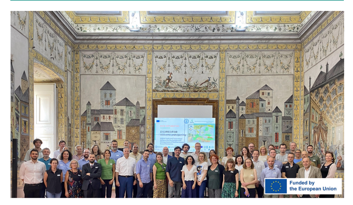
Introducing the EU Horizion project DigiMedFor

We are delighted to announce that ELARD is a partner in the DigiMedFor project! We are responsible for work packages 7 - stakeholders' engagement, dissemination and communication!